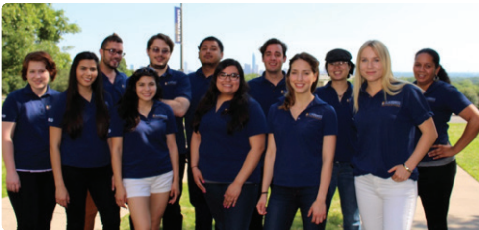
▲ 2013–2014 McNair Scholars Research Internship Cohort