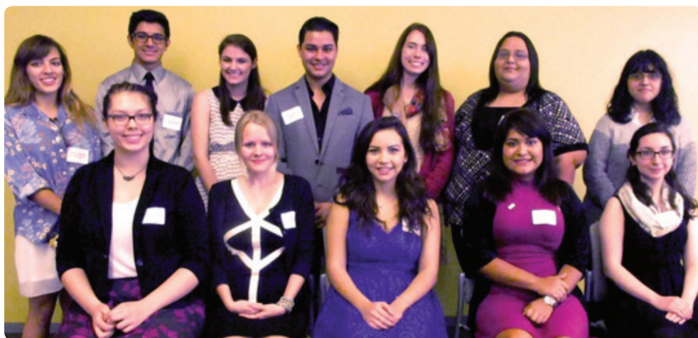
▲ 2014–2015 Cohort, December 2014