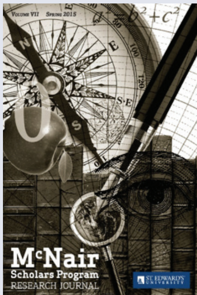
▲ Journal cover design by Laurel Kemper '15, Graphic Design