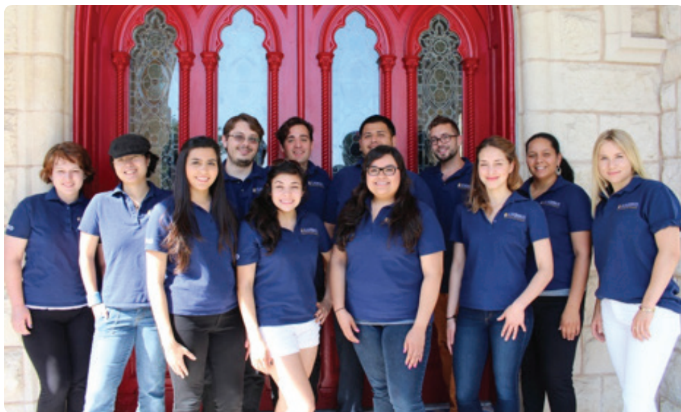
▲ McNair 2014 Summer Research Internship Cohort